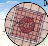
Decorative brick designs adorn beach access points