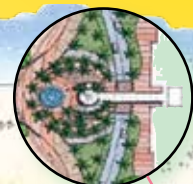
Central Plaza with sundial and water feature