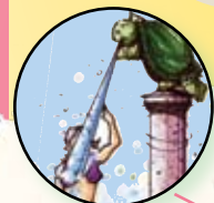
Turtle showers are sure to please young and the young at heart