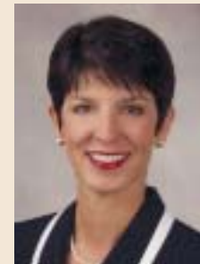
Whitney Gray Commissioner