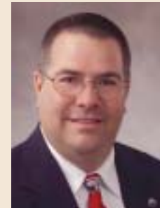
Hoyt Hamilton Commissioner