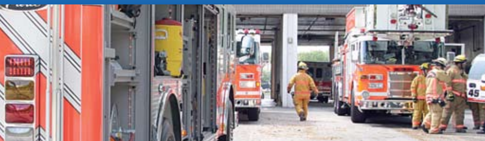
New fire vehicles were added to the department's fleet.

f... Fire & Rescue. The Fire Department improved public safety by revising more than 15 departmental policies and procedures, replaced two ladder trucks at no cost to the city, and ordered a third truck to replace the current 20-year-old reserve unit. Finance. The Finance Department received the Government Finance Officers Association Certificate for the 27th year. The city's pension plan investments continued to out perform the benchmarks. Feasibility. Clearwater Gas identified action plans for commercial and residential expansion feasibility to extend natural gas service within the city where it is not available. The Marine & Aviation Department completed a Feasibility Study for high and dry boat storage.