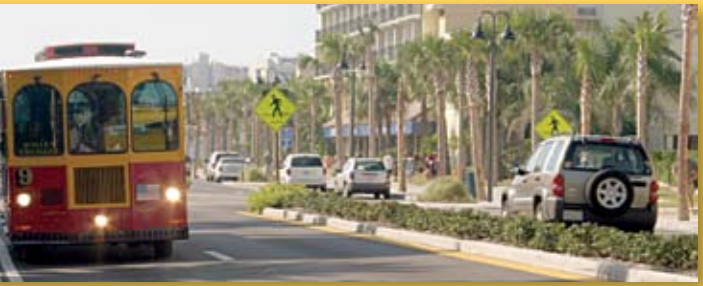
The Jolley Trolley makes regular trips throughout the beach and downtown.

J... ☀ Jazz Holiday. For the 27th year, the Clearwater Jazz Holiday showcased great musicians from around the world. ☀ Jolley Trolley. The Jolley Trolley is one form of alternative transportation available for the beach area. ☀ July 4th. Clearwater Celebrates America in Coachman Park on July 3rd and 4th. ☀ Jobline. Call 562-4870 to find out about city job openings. The Human Resources department hired 245 employees last year. ☀ Joint Venture. Many city departments work together cooperatively to complete such projects as Beach Walk, Cleveland Street and Myrtle Avenue.