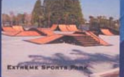
EXTREME SPORTS PARK