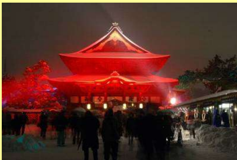
《Zenkoji Main Hall》