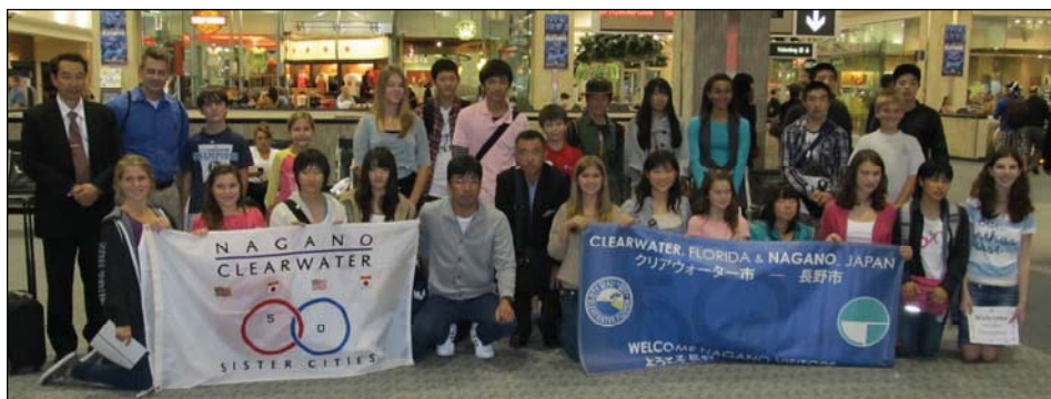
Host families greet their Japanese guests and pose with them for the traditional picture at Tampa International Airport.