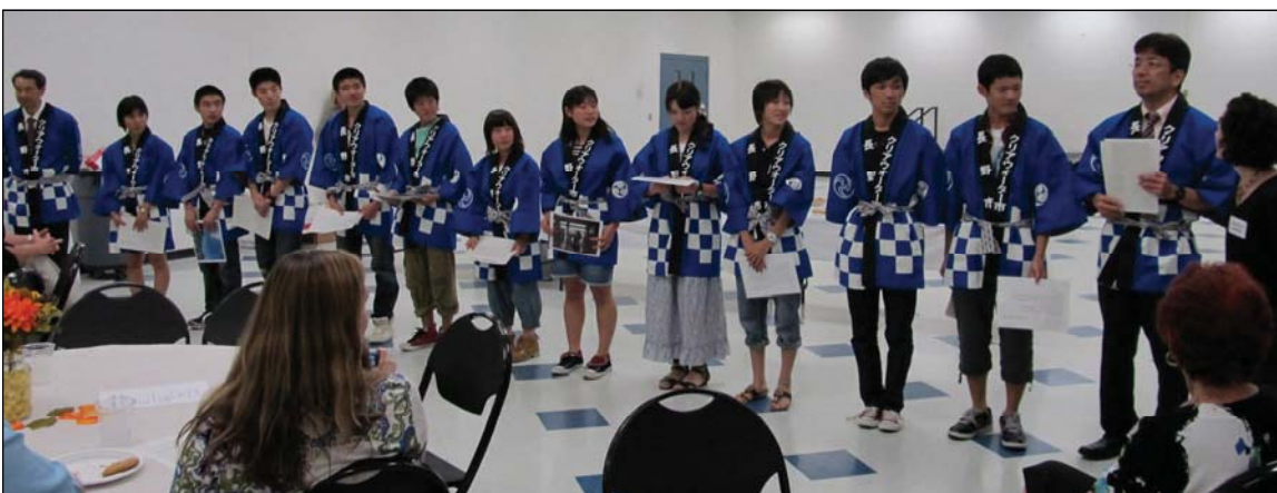
Our Japanese visitors always devise a wonderful performance for our Sayonara Parties. Students here added to the festivity by dressing in their Happi coats.