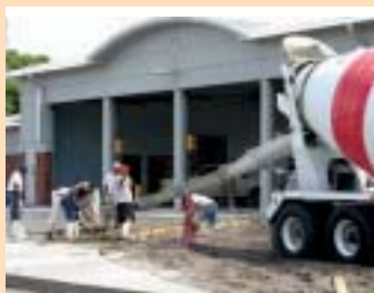
The Northwest Fire Station will open this summer.

This construction also prepares for the redesign of Alternate U.S. 19, which will improve traffic flow. When construction is complete, Missouri Avenue will become Alternate U.S. 19 from East Bay Drive North to Court Street, then will be routed west on Court Street to Myrtle Avenue and North on Myrtle Avenue to Ft. Harrison Avenue. Total project cost is $16.13 million.