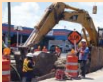
Myrtle Avenue construction includes an improved roadway drainage system and installation of new water mains, hydrants, gas mains and sewer pipes.

In April, construction work started on Myrtle Avenue between Lakeview and Fairmont. As infrastructure maintenance remains one of the City Council's five priorities, an improved roadway drainage system, installation of new water mains, hydrants, gas mains and sewer pipes