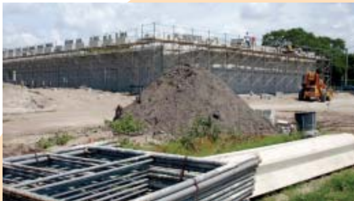
Construction is well underway on the Ross Norton Recreation Complex and Extreme Sports Park.

Clearwater is entering its second phase of redevelopment projects and infrastructure redevelopments. We ask residents, businesses and visitors for their continued patience as these projects progress. We are truly partners in building a brighter future together.