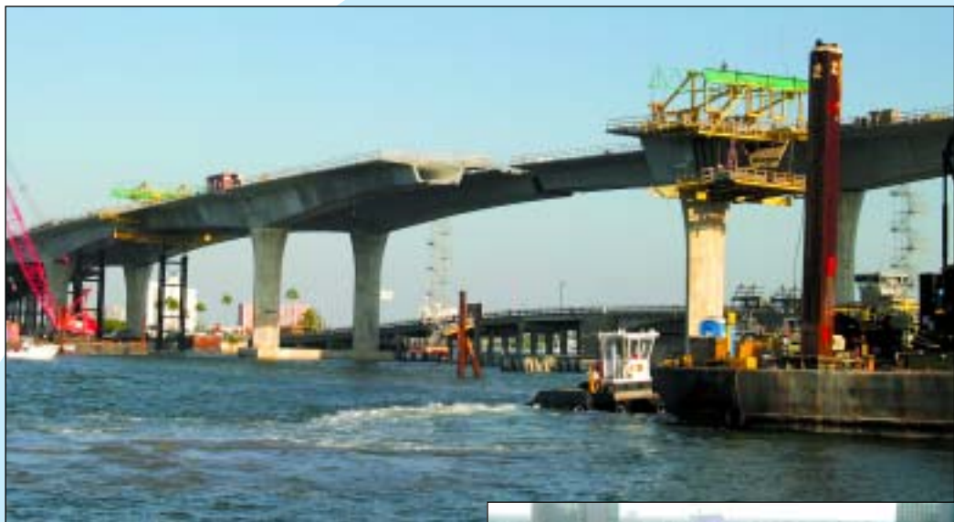
View of Memorial Causeway Bridge taken from mainland facing west.

Spring brings about new blooms throughout nature. Clearwater will celebrate new birth throughout the City this spring as many projects come to fruition. Residents, businesses and visitors have been patient through many of these projects and will soon start to enjoy the new facilities and infrastructure. We are truly partners in building a brighter future together.