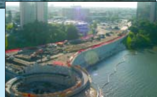
Above: The pedestrian helix, connecting the Pinellas Trail to the bridge and beach.

The seats are installed, the field has been planted and the scoreboard is hung at the new Community Sports Complex. The complex, which will accommodate approximately 8,000 fans, will serve as the home of many local youth and adult baseball activities, the Philadelphia Phillies Spring Training, and Clearwater Threshers. Amenities include an expanded food court area, a grass seating/picnic berm, suites, and a full children's playground. The new complex, on U.S. Highway 19 just north of Drew Street, is conveniently located and accessible. It will be ready for the 2004 Spring Training season with the grand opening at Phillies Phan Fest on February 27.