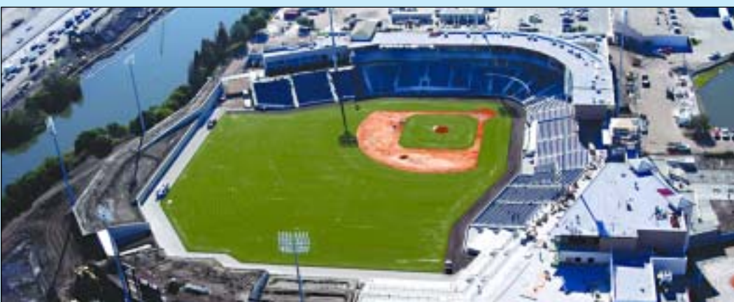
Below: The grand opening of the Community Sports Complex will be February 27 at Phan Fest.