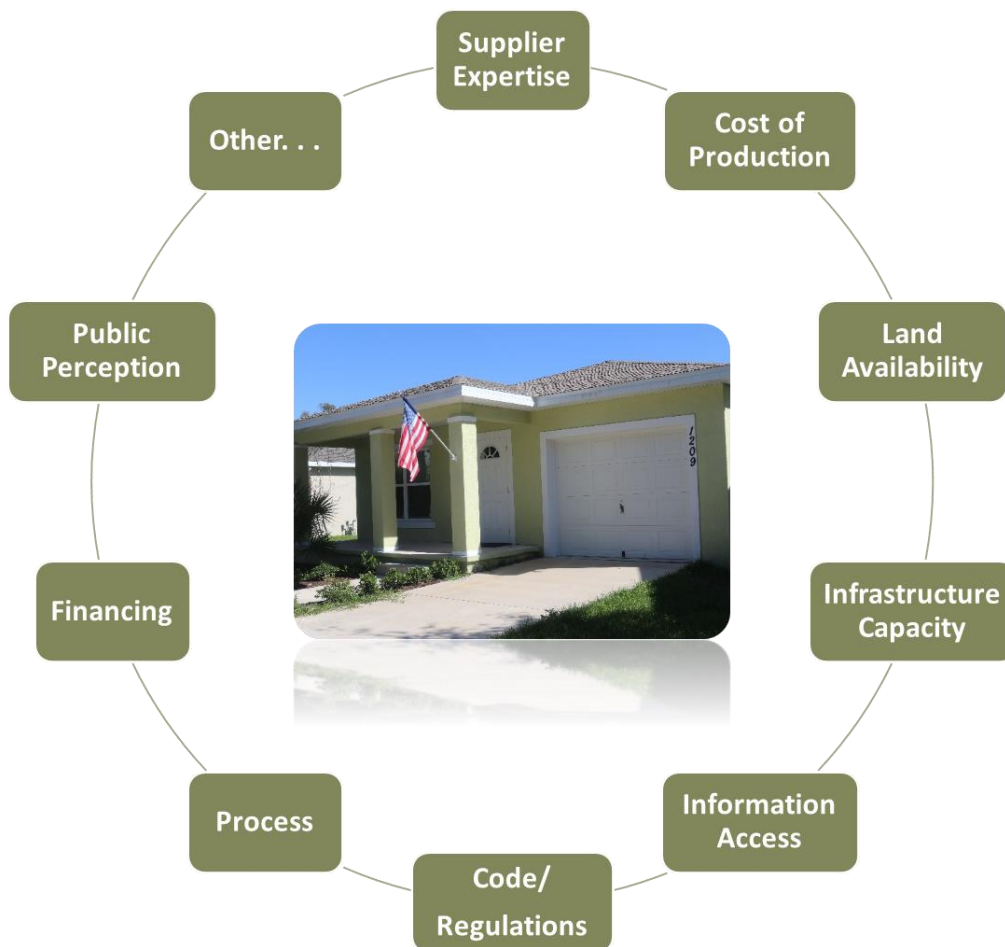
Chart 1: Affordable Housing Barriers

Chart 1 summarizes potential barriers to affordable housing.