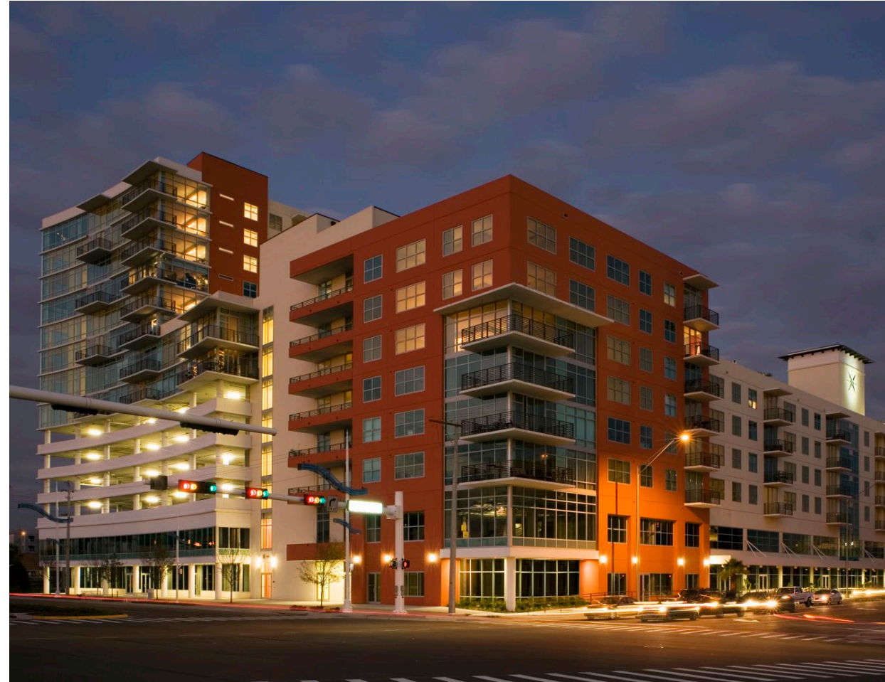
Grand Central at Kennedy Tampa, FL