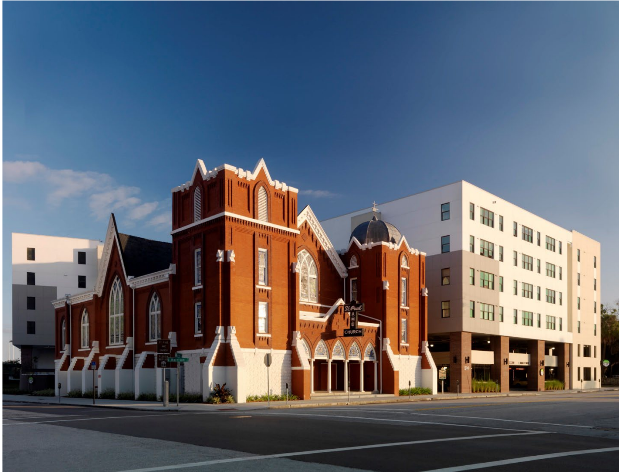
Metro 510 Apartments Tampa, FL