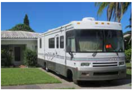
Residential parking - RV in front setback