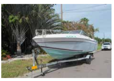
Boat in right of way