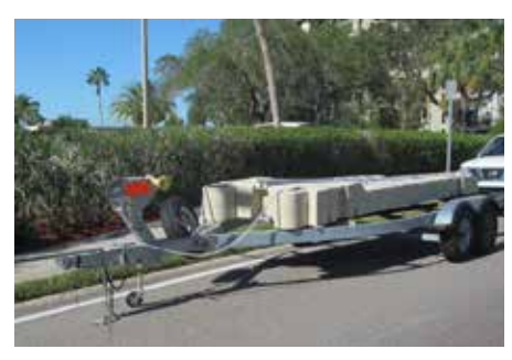
Trailer in right of way