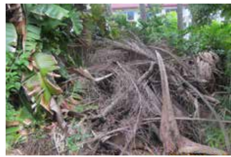
Nuisance - Brush