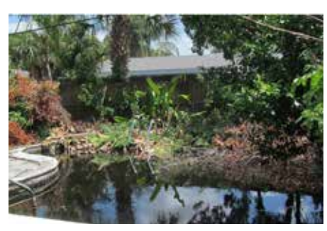
Nuisance - Pool maintenance