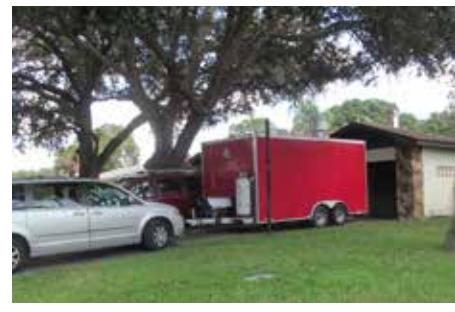
Residential parking - Trailer in front setback