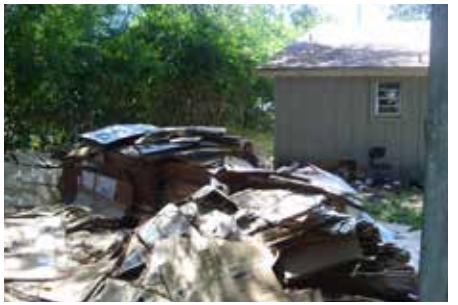
Nuisance - Debris